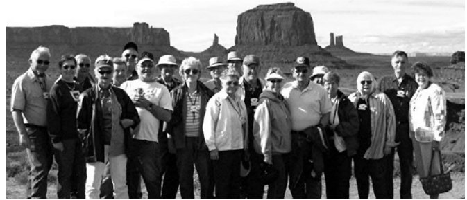
Discovery Pioneers at John Ford's Point, Navajo Tribal Park, Monument Valley, Arizona