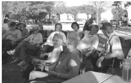
First evening gathered around the campfire at the rolling rally.