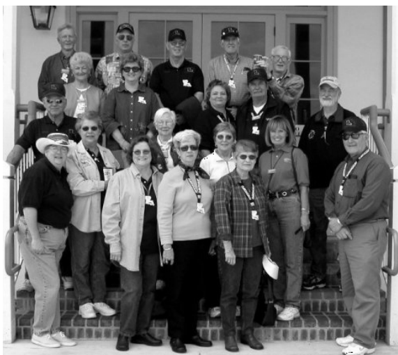
Letting the good times roll, these Mudbugs had a ball.