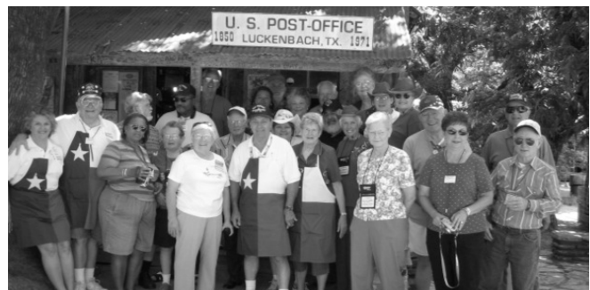
Discovery Texans in Luckenbach. The aprons indicate the rally hosts, who prepared the meals.