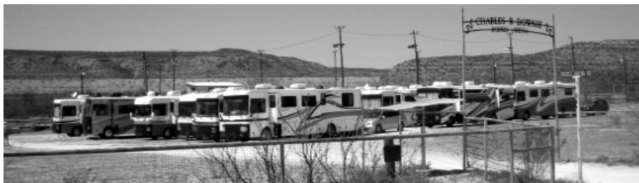
The rigs parked in the cow pasture in Sanderson