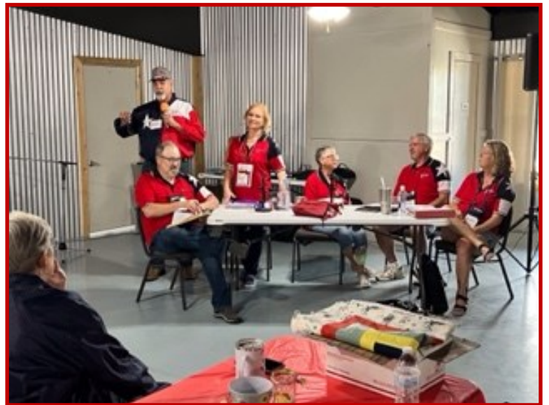
Discovery Texans work on quilt for National Rally