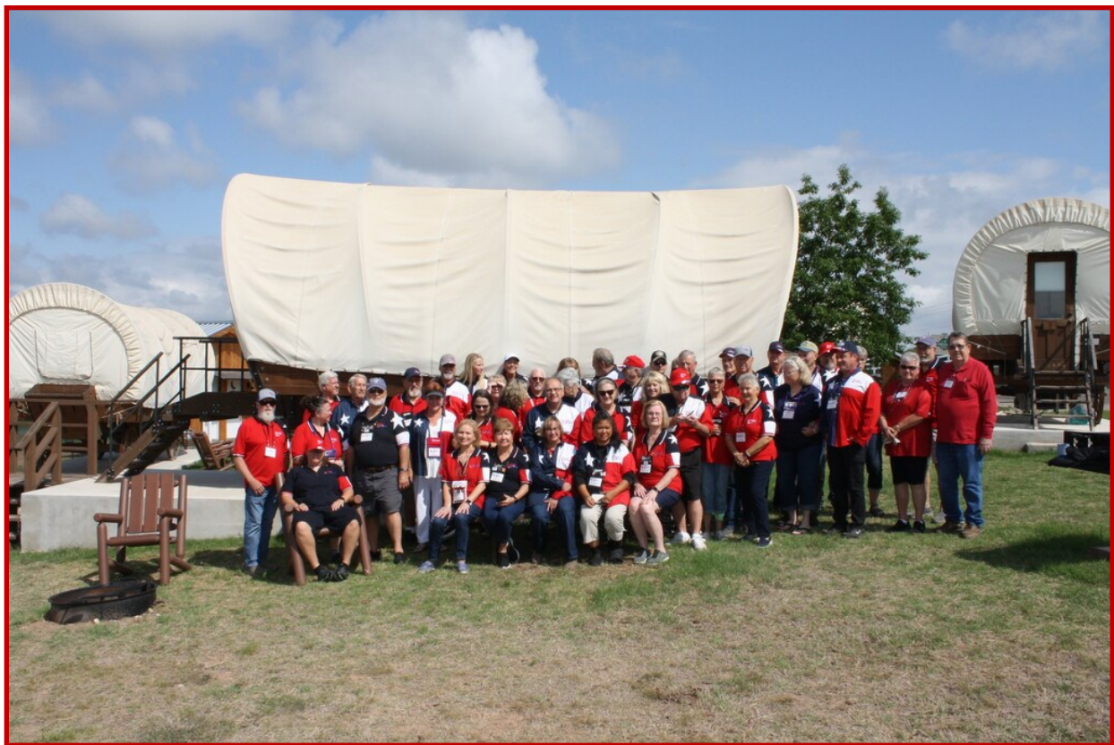
Discovery Texans group photo with covered wagons at Fredericksburg, TX