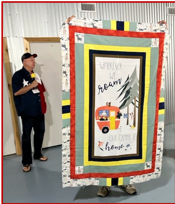
Quilt for the National Rally