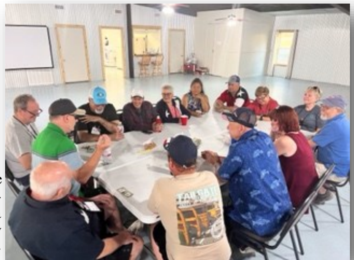
Left-Right-Center at the rally hall