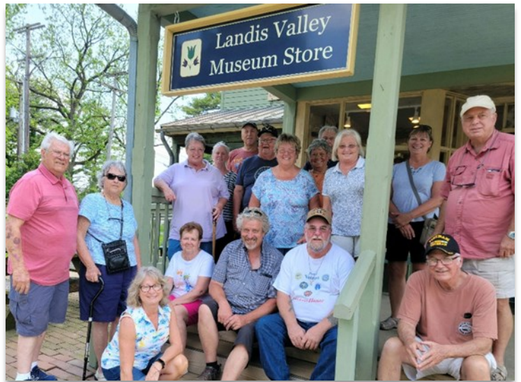
The crew – we had 11 coaches and 22 people, a few canceled, one due to a break-down, imagine that. However, we managed to have a great time