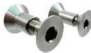
Barrel bolt and nut

Cut the aluminum stock in to two 9 1/2" long pieces to make the arms. The barrel bolt is placed 1/2" from the ends as a pivot between the two but it's not centered; it's placed in the center of the bottom half: