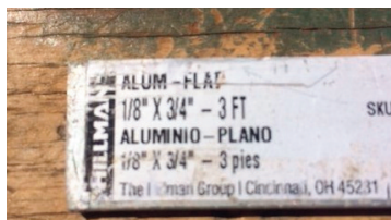
Aluminum flat stock

All that's needed is a 2-foot piece of flat 3/4" aluminum stock, a barrel nut and bolt, and two small sheet metal screws with flat heads. The tools required are a drill, a hacksaw, a file and a phillips-head screwdriver.