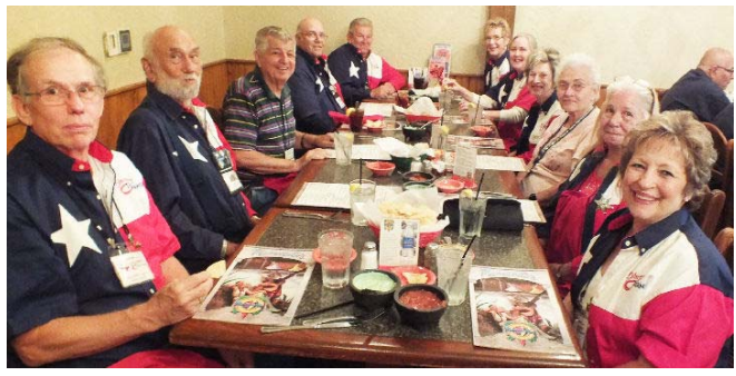
Photos of Discovery Texans at the feeding troughs... er, the dining tables at Mamacita's in Fredericksburg.

May 18-21, we were in Stonewall, Tex., at the Peach