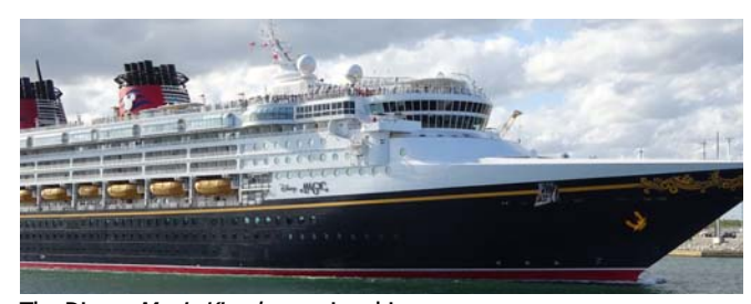
The Disney Magic Kingdom cruise ship.