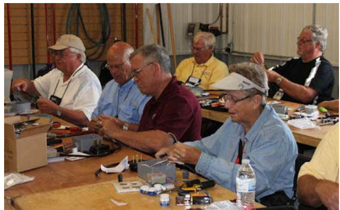
The 50 amp tester workshop was a big hit.