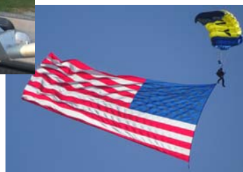
Skydiver in Florida during → Florida Discovery Sunshiners rally