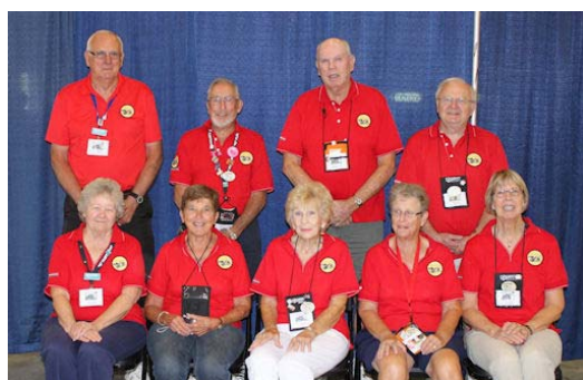
Heartland Discoverys chapter