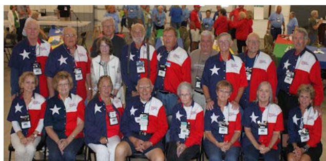
Discovery Texans chapter