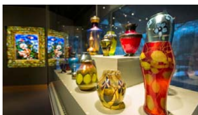
Corning Museum of Glass

← Corning Museum of Glass ( www.cmog.org/ ) is the world's largest glass museum. Explore 35 centuries of glass art, history and technology. Discover how glass has changed the world in the hands-on Innovation Center. And, you can make your own glass souvenir. Corning also is the home to the Rockwell Museum, which features the art of the American experience, plus a collection of historic firearms. Just steps away is the Gaffer District, a brick sidewalk area in charming downtown Corning, where you will find boutiques, antique stores, specialty shops, galleries, and restaurants.