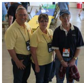
Louisiana Mudbugs chapter