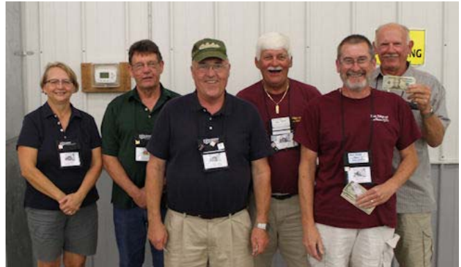
Card sharks ... oops, I mean, card bingo winners had a great time and profited nicely!