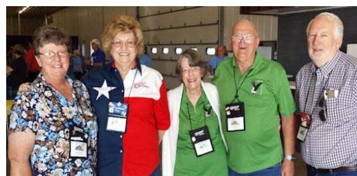
Northwest Adventurers chapter