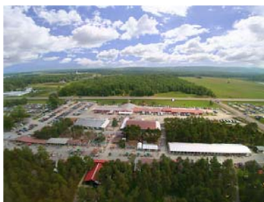
Windmill Farm & Craft Market

← Corning Museum of Glass ( www.cmog.org/ ) is the world's largest glass museum. Explore 35 centuries of glass art, history and technology. Discover how glass has changed the world in the hands-on Innovation Center. And, you can make your own glass souvenir. Corning also is the home to the Rockwell Museum, which features the art of the American experience, plus a collection of historic firearms. Just steps away is the Gaffer District, a brick sidewalk area in charming downtown Corning, where you will find boutiques, antique stores, specialty shops, galleries, and restaurants.