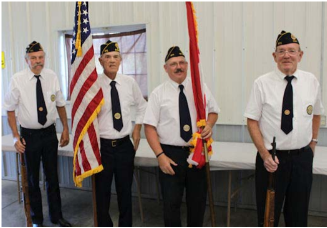
American Legion Post #671 color guard from Swisher, Iowa, opened our week in Amana Colonies.