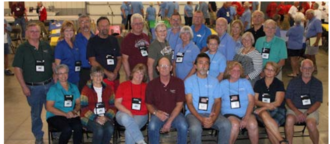
These good-looking people were attending their first DOAI national rally. We hope they had a good time, and we look forward to seeing them at future DOAI rallies.