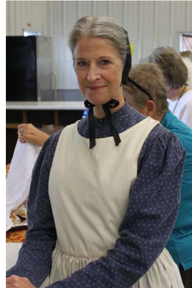
Oma's Tales gave us a taste of what it was like years ago in the Amana Colonies.