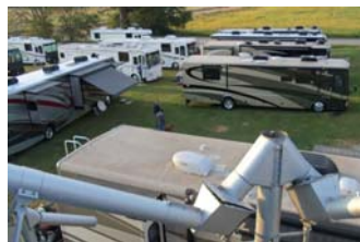
← RVs in Jerry Call's backyard during Midwest Discoverers rally