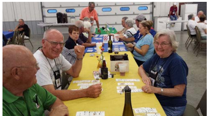
Card bingo was fun and frustrating. All you need is that one last card, but oh no! someone else's card gets called first! Argh!

Make plans now to attend the 2016 national rally in New York. There will be so many things to see and do that you might be wise to plan on coming early and staying late. The rally team is working now to give you a rally worth attending, a rally worth remembering. See you in New York! ❖