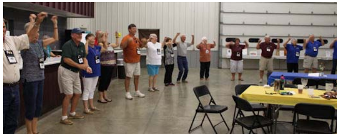
Cluck! Cluck! It's the chicken dance!