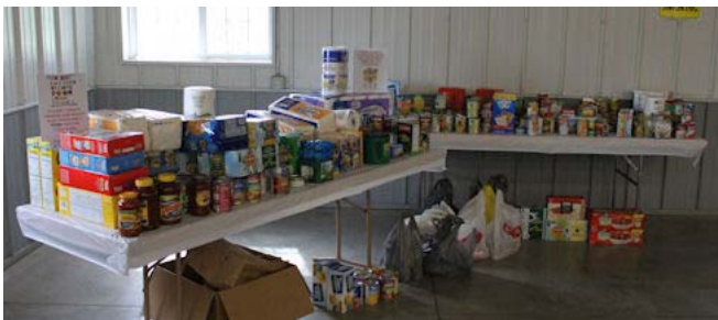
The local area food bank also profited by our generous donation of foodstuffs. Thanks to all of you for helping feed those in need!