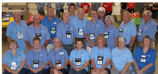
Blue Ridge Discoverys chapter