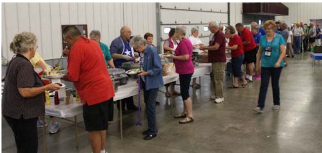
Between the grilled hamburger meal one evening, oven fresh pizza another, steaks grilled to perfection on another evening, then a fantastic potluck that was simply overwhelming, plus delicious breakfasts ... well, we all ate like kings and queens!