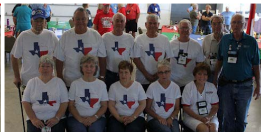
Texas Discovery Road Runners chapter