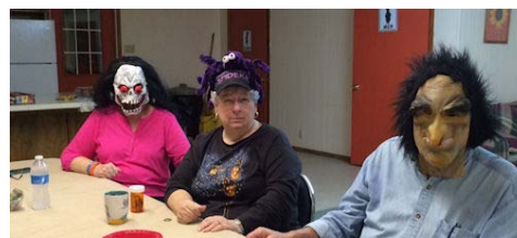
Texas Discovery Road Runners