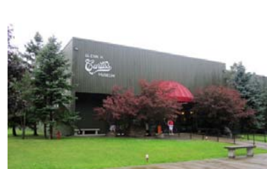
Glenn Curtiss Museum

Hammondsport is where you will find the Glenn → Curtiss Museum, "Where Biplanes Soared and Motorcycles Roared" ( www.glenncurtissmuseum.org ). Glenn Curtiss was an inventor, held 87 U.S. patents, held the motorcycle speed record, and made the first U.S. city-to-city flight. There is so