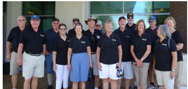
Florida Discovery Sunshiners