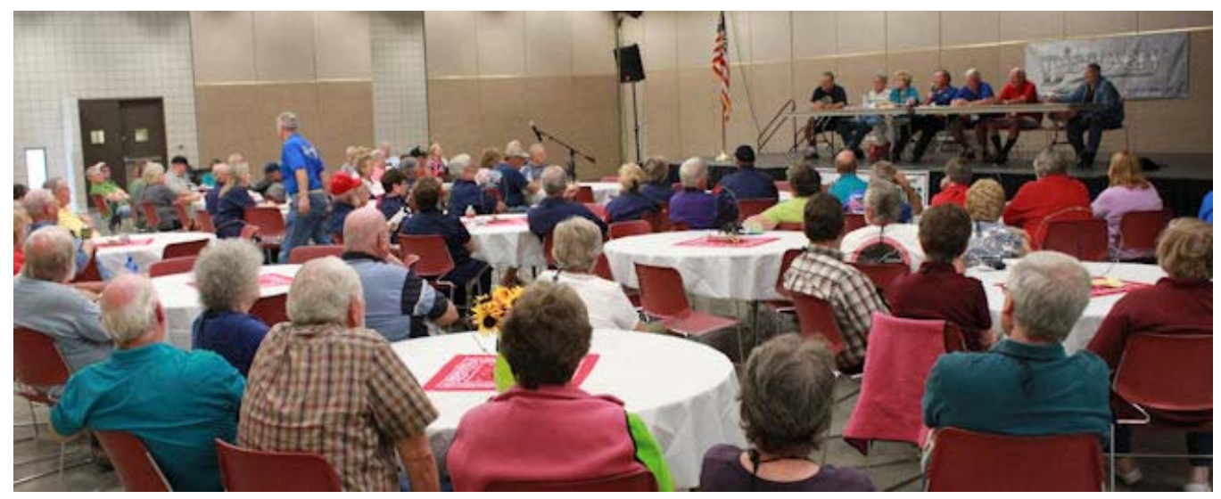
The general meeting gave everyone an opportunity to participate in the operation of DOAI.