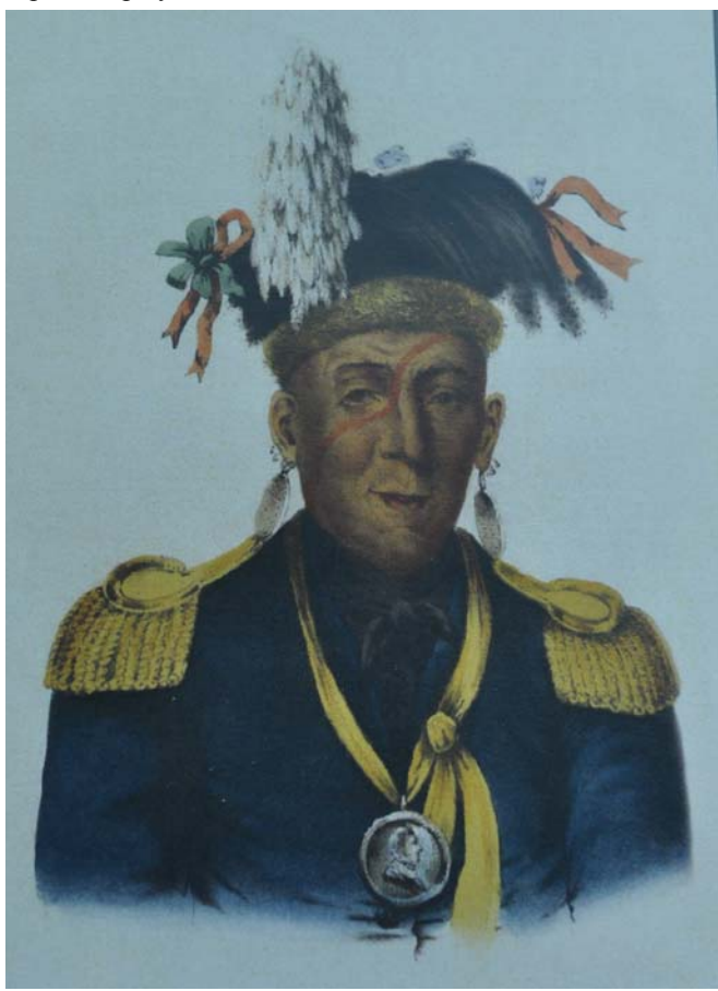
Wa-baun-see, a Potawatomi chief (spelled Wabansi in contemporary Potawatomi language)

valuable treasure preserves for future visitors and researchers material that could have been lost forever. We may have never known what these chiefs, warriors, princesses and common people looked like, except for the folio volumes with the lithographs, the generous donation, and the creation of this superb display.