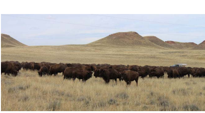
Tour of the bison ranch was fascinating and educational.