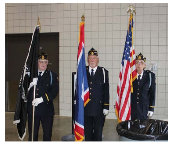
Color Guard at Welcome Party