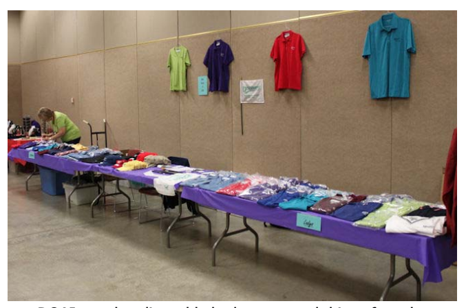
DOAI merchandise table had many good things for sale.