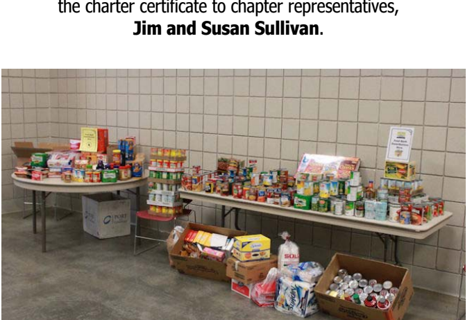
The tables were loaded with more than 670 pounds of foodstuffs. Thanks to everyone for being generous!