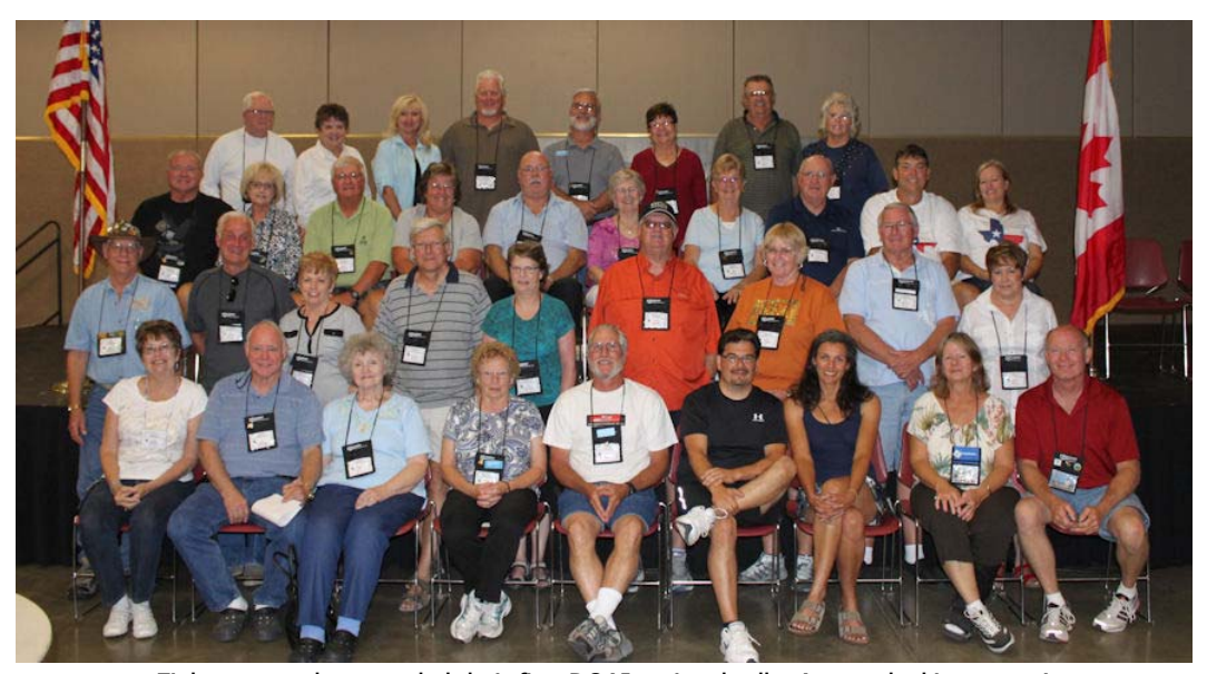
Eighteen couples attended their first DOAI national rally. A great looking group!