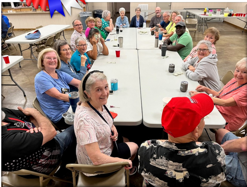
Playing Left, Center, Right (LCR) in the rally hall