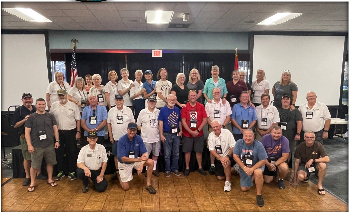
Florida Discovery Sunshiners