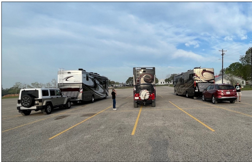
Sunrise on the last morning leaving the March rally in Hallettsville, Texas

Rusk, TX Hallettsville, TX Kerrville, TX Abilene, TX