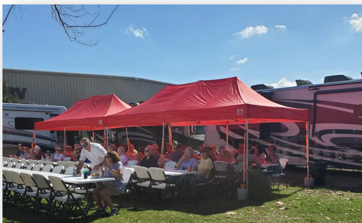
General RV Day