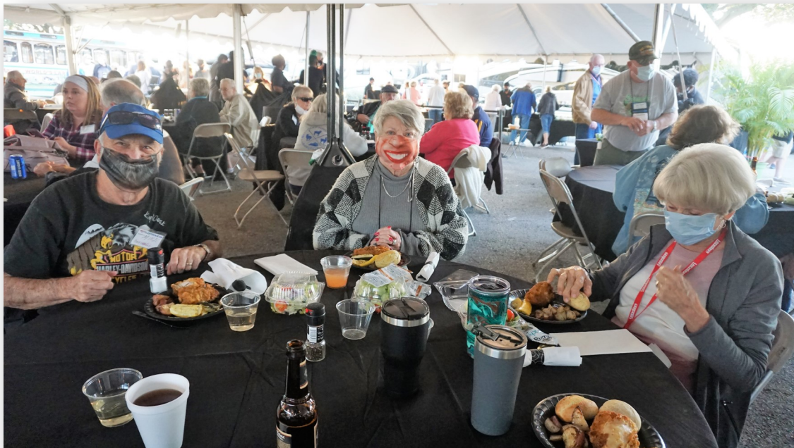
21 Jan 2021, Seffner, FL, FMA Rally Tent