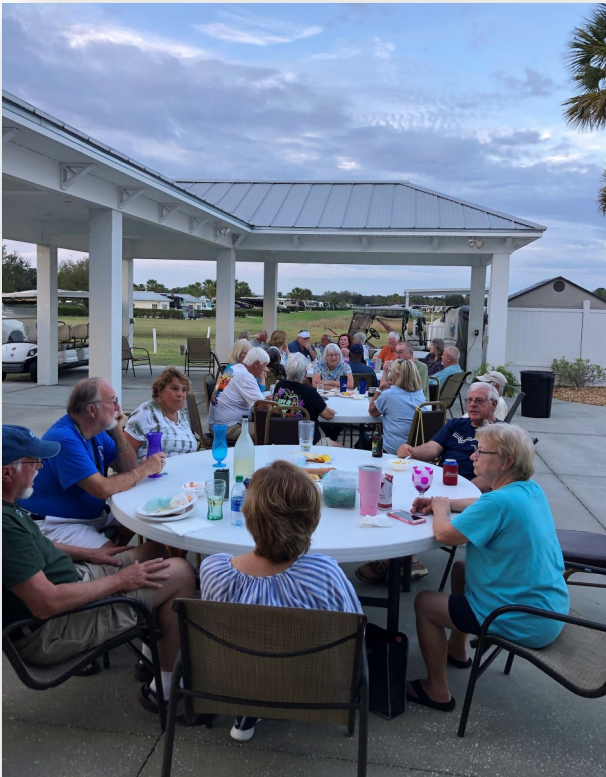
Blue Ridge Discoverys enjoy a “low country boil” outside the clubhouse at Florida Grande