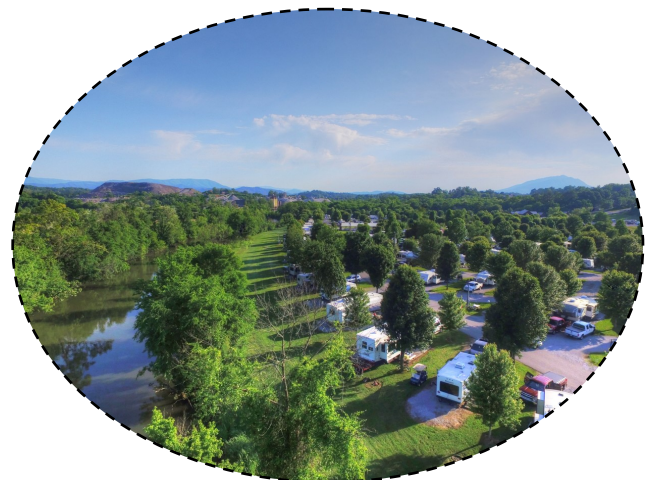
Sun Outdoors Sevierville, Pigeon Forge, TN