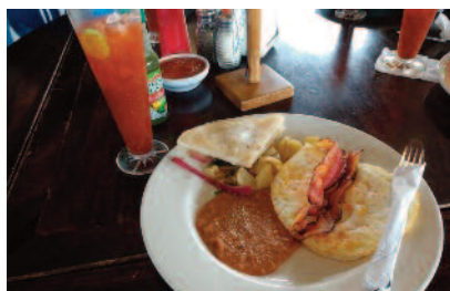
Back in town for a free Bloody Mary Breakfast (you buy the Bloody Mary and the Breakfast is free), Yum!