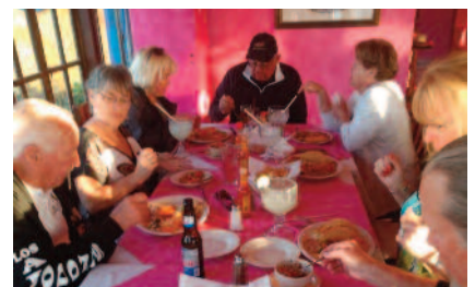
At the Captain's Table