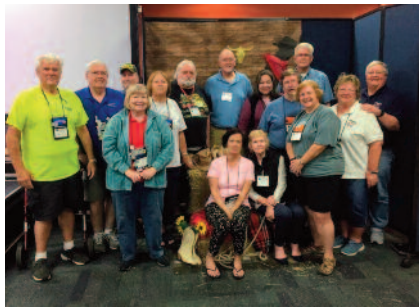
Noreaster Discoverys at the SE Region Rally - Camp Discovery in Seffner, FL.

We are so glad to have you as new members, Welcome! Safe travels everyone. ❖