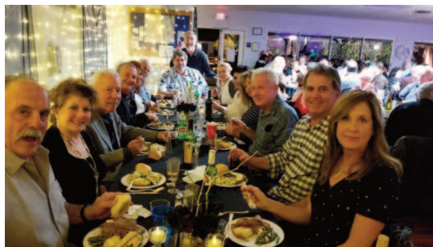
Discovery California New Year's Eve dinner with friends