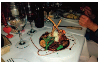
With great food for all