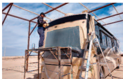
Paint and Repairs