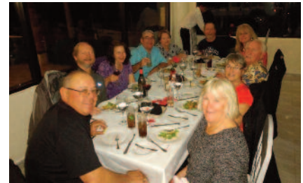
Valentines dinner Italian style at Mar Blue