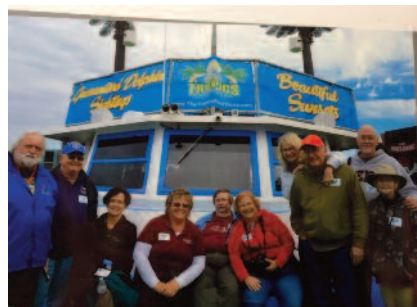
Dolphin Cruise in Clearwater Beach, FL