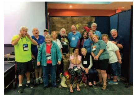
Oh No! Elvis has left the building!