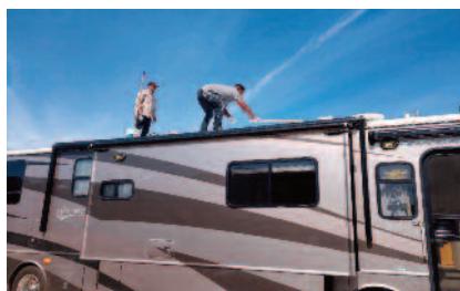
Becky and Jerry Timberlake had new roofing material and coating installed on their D