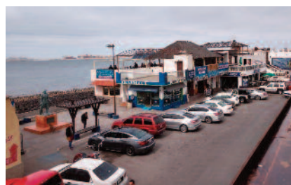
Downtown Puerto Peñasco