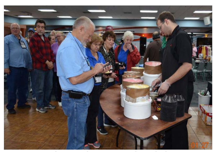
Here's a scoop: the ice cream social was a big hit.