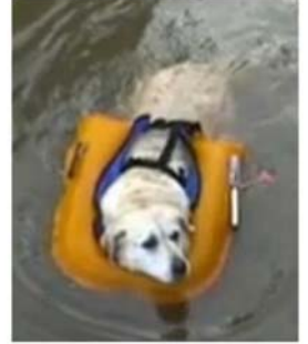
The only self-inflating life jacket for pets!