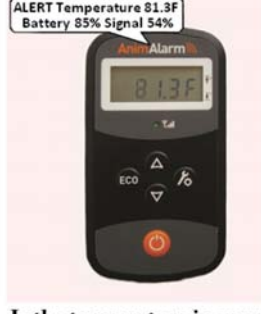
Is the temperature in your RV too hot for your pet?